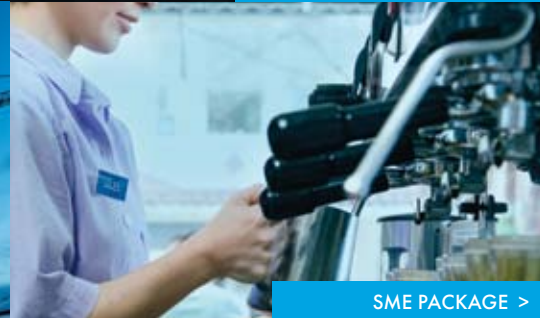
SME PACKAGE >