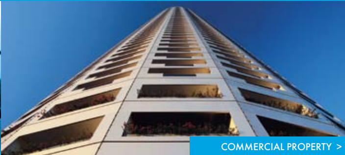
COMMERCIAL PROPERTY >