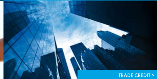
TRADE CREDIT >