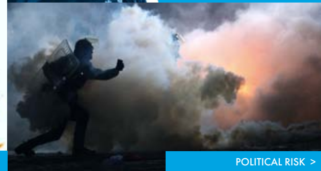
POLITICAL RISK >