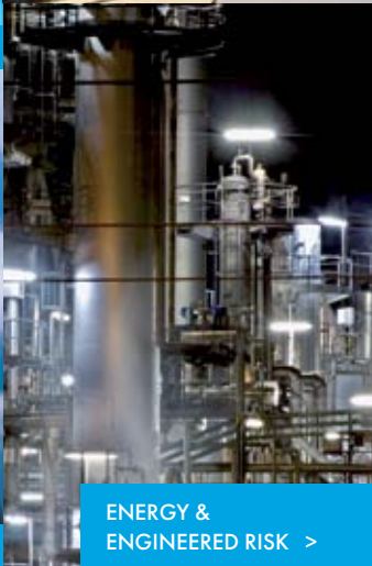
ENERGY & ENGINEERED RISK >