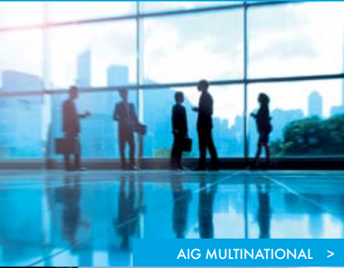
AIG MULTINATIONAL >