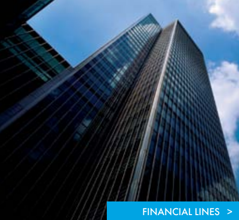
FINANCIAL LINES >