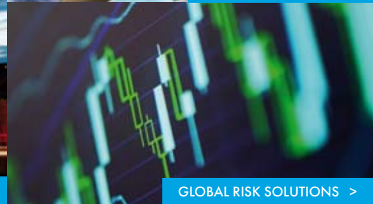
GLOBAL RISK SOLUTIONS >